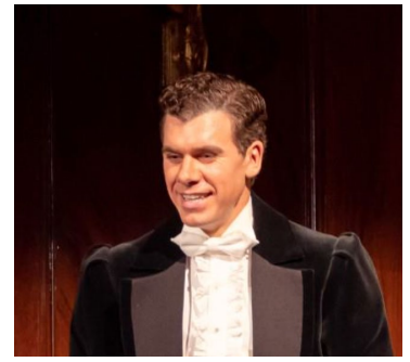
Raoul Vicomte de Chagny

The Phantom lives beneath the Opera House. He wears a mask to hide his face. He loves Christine. He writes music and is a dangerous man.