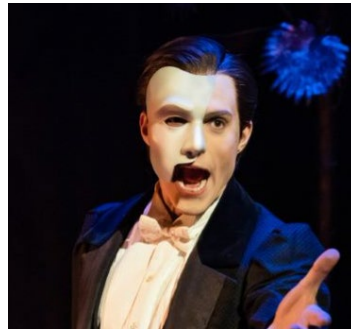
The Phantom of the Opera

Christine is a singer and dancer. She and Raoul were friends when they were children.