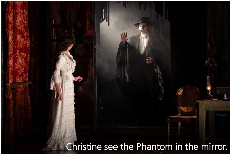
Christine see the Phantom in the mirror.